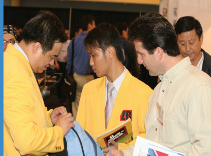
Exhibit Hall Hours

To better accommodate your buying schedules and preparations for the busy holiday retail season, Paperworld USA has moved its show dates to June to help maximize participation among buyers and sellers!